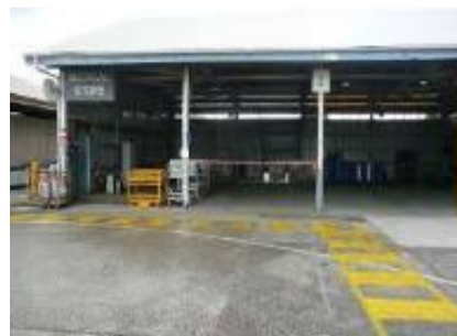
Vehicle Loading Bay – With traffic / exclusion zone separation controls.