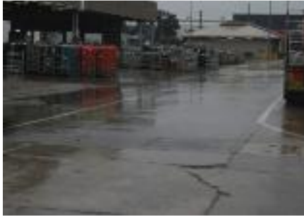
Vehicle Loading Bay – No controls.