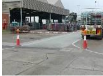
Vehicle Loading Bay – With traffic / exclusion zone controls / flashing hazard lights for night work.