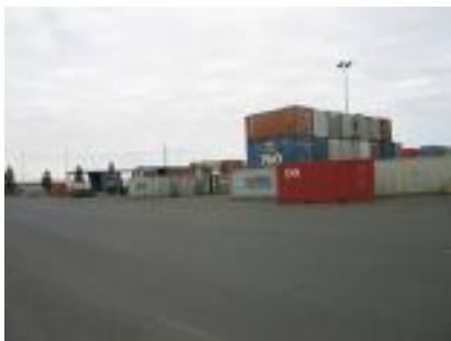
Container yard – No controls.