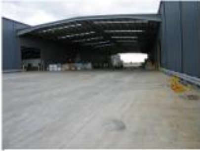
Awning area – No controls.